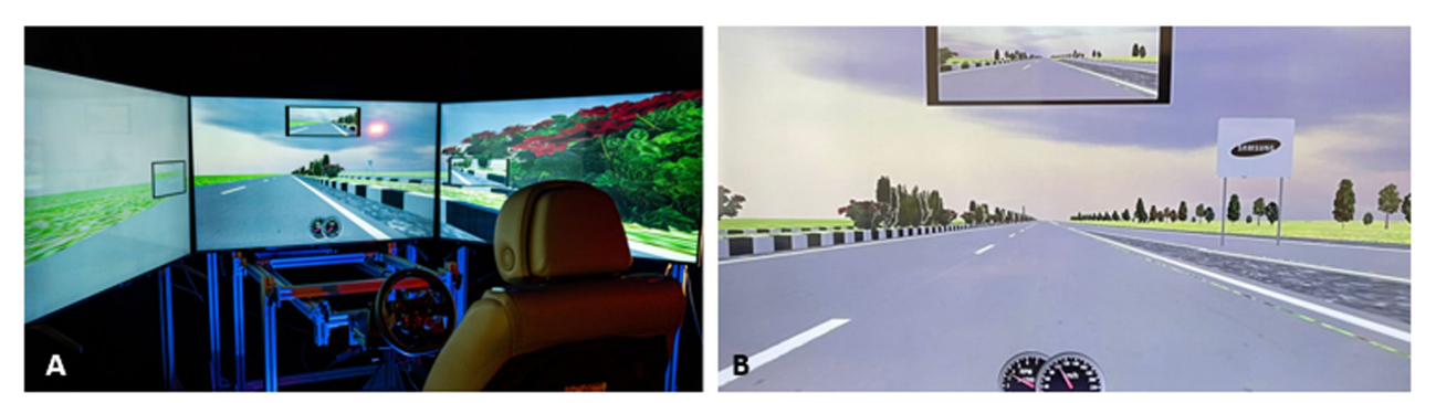
Fig. 1 Photos of the driving simulator (A) and a driving scenario and billboard (B) used in the study